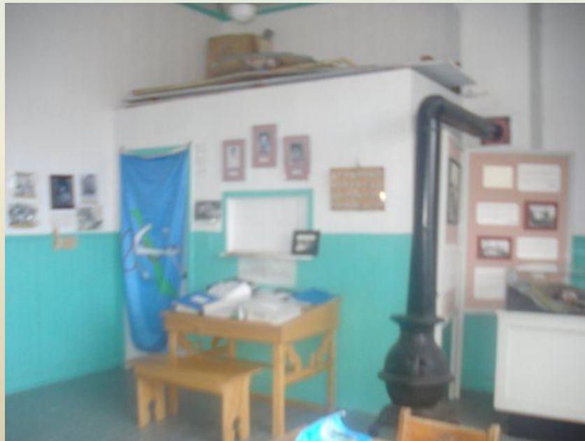
Small kitchen that was built inside the school after it's closing.

After it's closing, the school was used to hold events such as small dinner theaters and church suppers. It was also used a scene for the short film Turning the Page that was presented in the "The Nickel Independent Film Festival & Video Festival" "I'm surprised that you weren't part of that video. A lot of the young crowd from down around here were asked to sit in the desks and be students"