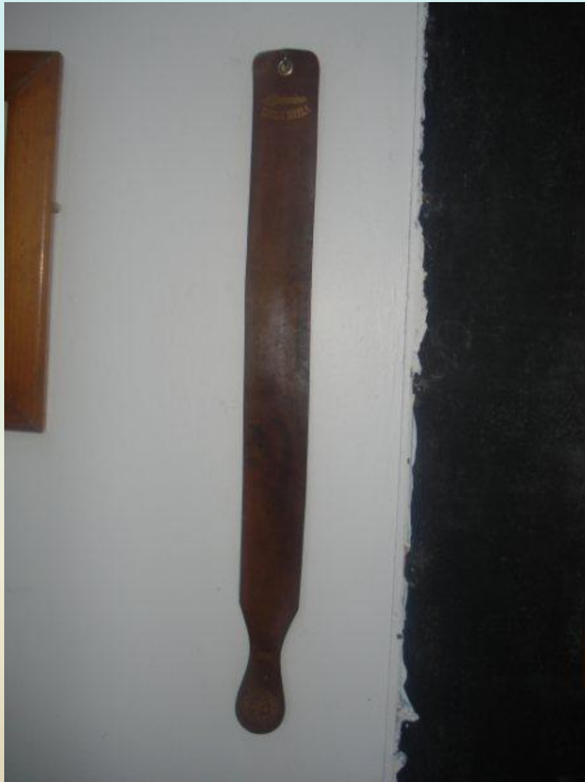
Leather “School Strap”

One of the most eye catching articles in the school is the leather strap hung on the wall next to the chalkboard. “I can't recall ever getting the strap, but I can surely remember those who did. Whether it was for not washing your hands before you arrived at school or for horsing around during class, it didn't matter, you'd get it right across the palm of your hands or across your knuckles.”