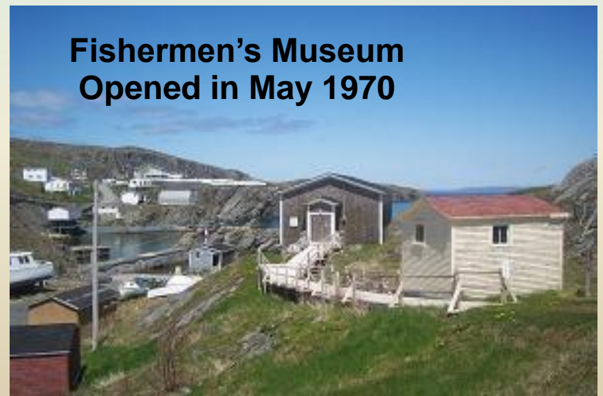
Fishermen's Museum Opened in May 1970