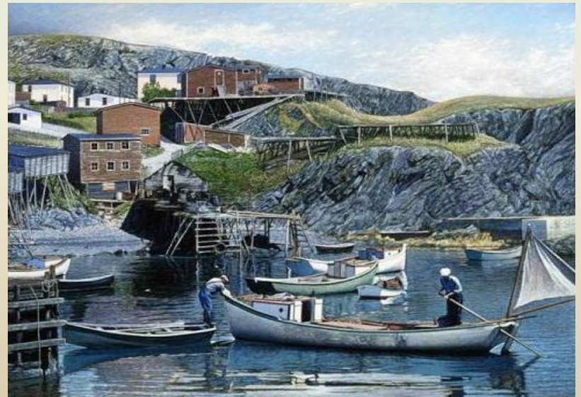
The Fishermen of Hibb's Cove, 2003