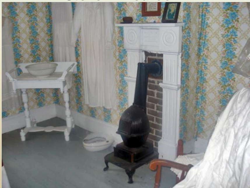
Stove in Bedroom